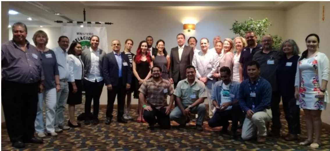
Group Photo 14th IAC Scientific Committee Meeting Panama, October 18- 20, 2017

The Inter-American Convention for the Protection and Conservation of Sea Turtles 14 th Scientific Committee Meeting took place in Panama City on October 18 – 20, 2017, with the support of Panama IAC Focal Point at the Ministry of Foreign Affairs. The meeting was attended by the delegates from Argentina, Belize, Brazil, Caribbean Netherlands, Chile, Costa Rica, Ecuador, Guatemala, Honduras, Mexico, Panama, Peru, Uruguay and the United States, who welcomed the delegate from the new IAC Party, Dominican Republic. The 26 participants included representatives from the Aquatic Resources Authority of Panama (ARAP in Spanish), from the Ministry of Environment Department of Coasts and Sea, and observers from WIDECAST and JustSea Foundation.