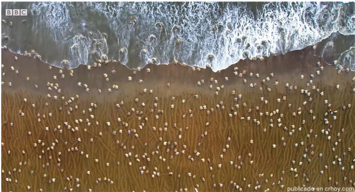
Sea turtles Arribada in the worldwide famous Ostional