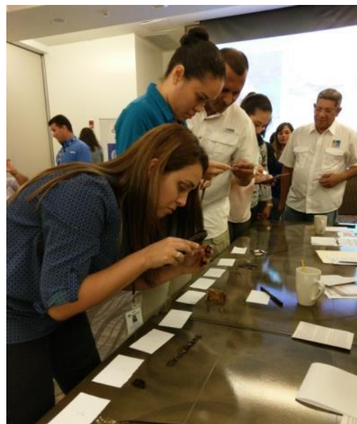
Hawksbill products identification