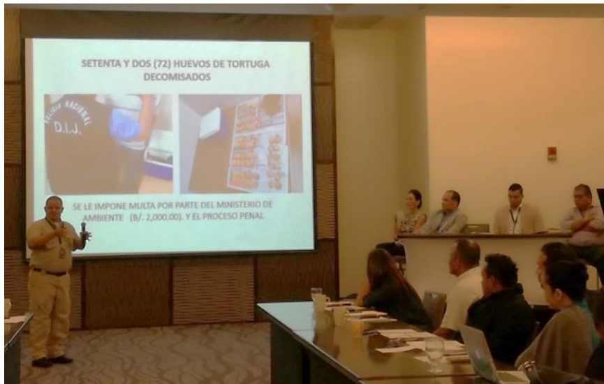
Presentation of the first criminal proceeding in Panama due to sea turtle eggs traffic.

The participants learned about the approval of Panama Action Plan for the Protection of Sea Turtles 2017 – 2021. Additionally, there was a review of the current regulations and their implementation in Panama, including a presentation of the first criminal proceeding that resulted in a $2,000 dollars fine to an individual because of illegal traffic of sea turtle eggs.