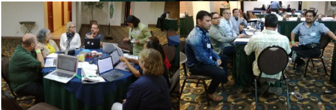
Scientific Committee Working Group Session – Panama