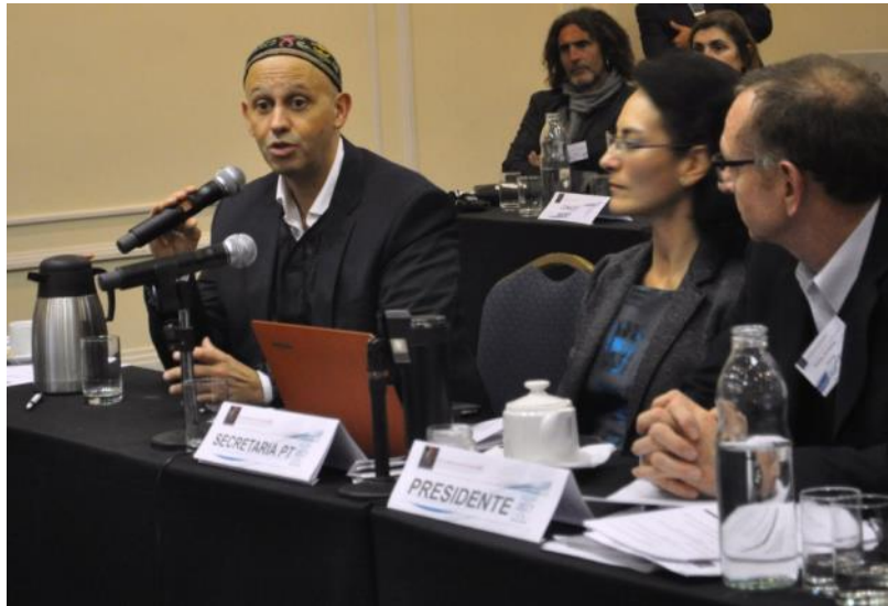
Minister of Environment of Argentina Rabbi Sergio Bergman welcomes the COP8

The Minister of Environment Rabbi Sergio Bergman welcomed the participants expressing good wishes for a productive meeting and a joyful stay in Buenos Aires.