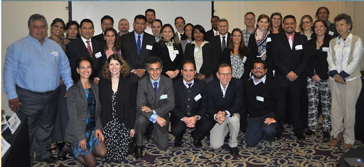
Group Picture IAC Conference of the Parties Buenos Aires, Argentina