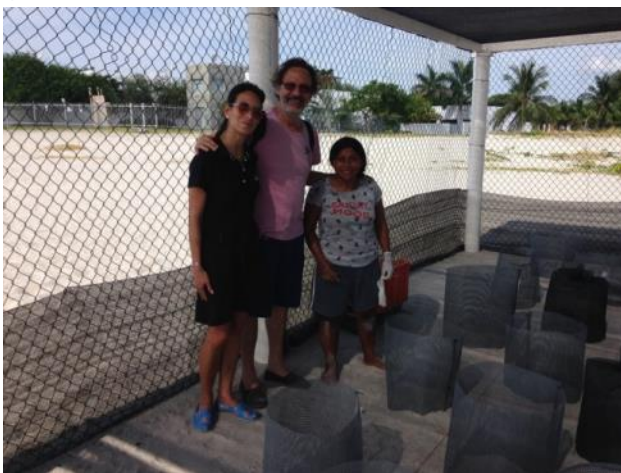
IAC representatives in Punta Chame (Panama)