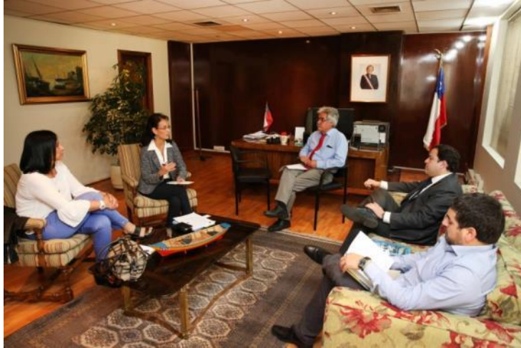
Undersecretariat of Fisheries and Aquaculture Chile © Mirko Sánchez- SUBPESCA

As a result from the meetings, and following up on the implementation of actions under the East Pacific Leatherback Resolution, IFOP will carry out workshops with fishermen on best practices to handle and release sea turtles incidentally caught in longline and gillnet industrial and artisanal fleets to strengthen compliance with the Resolution. The Fisheries Undersecretariat expressed their support by helping to achieve good attendance from the fishing sector. The Fisheries Undersecretariat and IFOP expressed their commitment to continue supporting the national sea turtle working group as they implement the sea turtle conservation measures that have been recommended for Chile under the IAC.