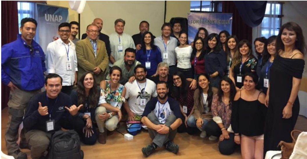
Participants of LaudOPO workshop on bycatch – Arica, November 29 th , 2017

On November 29th, 2017, the members of the East Pacific Leatherback Network (LaudOPO) met at the “LaudOPO Workshop on Bycatch”. Objectives of the workshop included updates of conservation projects, monitoring and the measures for reduction of bycatch, as well as identifying priorities and next steps regarding bycatch in the region. The workshop was held in the framework of the VI Sea Turtle Symposium in Arica.