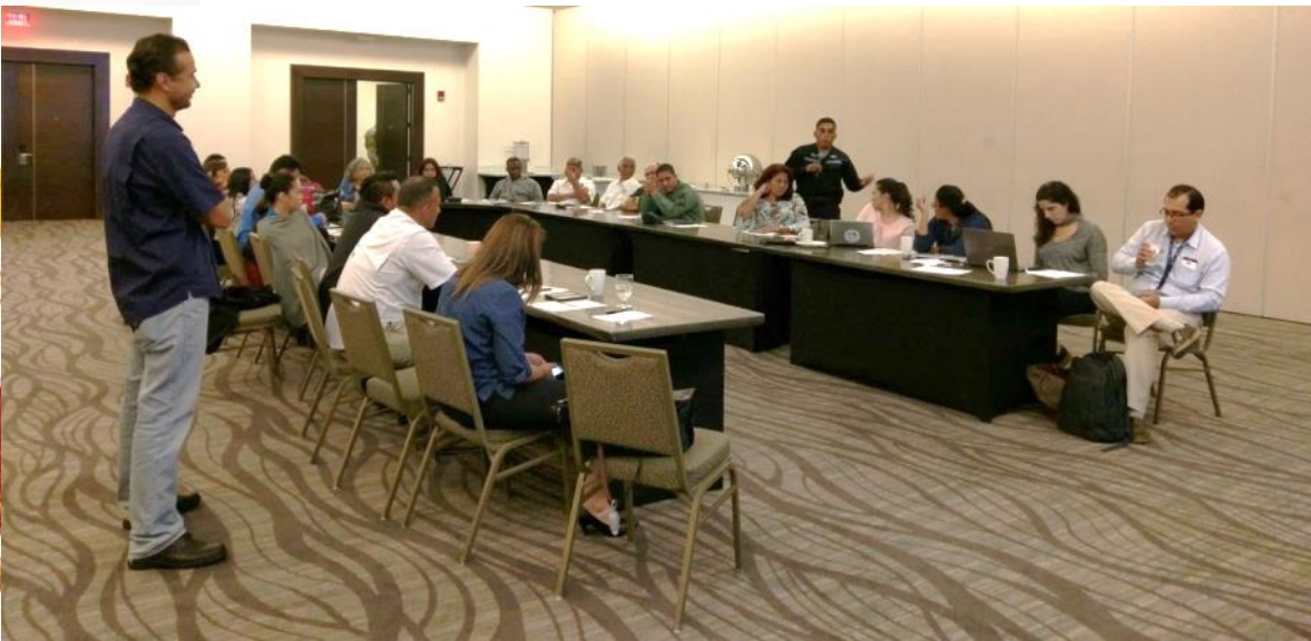
Workshop Participants

In the framework of the capacity building strategy regarding sea turtle conservation, the Ministry of Environment of Panama through their Coastal and Oceans Agency, and with the support of the United Nations Development Program (UNDP) convened representatives of judicial and environmental agencies at a “Workshop on hawksbill turtle Eretmochelys imbricata products identification, and the country commitments under IAC Convention” carried out on October 17, 2017 in Panama City.